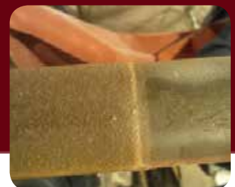
Boiler Tube After 2 Years Service