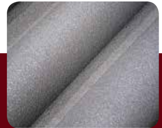
Boiler tube prior to installation

The results showed that the tube showed no wear. The outside dimension of the tube was measured before installation and after 2 years of service the OD of the tube was the same as the initial measurement.