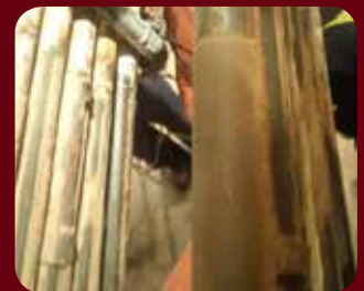
Boiler Tube After 2 Years Service