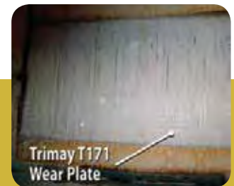
T171 after 410,000 tonnes

The T171 overlay wear plate was prematurely removed from service for maintenance after deflecting more than 1 million tonnes of ore. The comparison materials were completely worn and the skip needed to be re-lined, even though mine engineers estimated T171 to deflect another 1 million tonnes before requiring replacement.