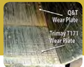
T171 after 1,050,000 tonnes